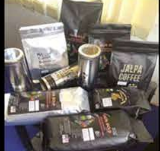
(58) Hospitality, Food & Wine, Monthly

Arabica coffee beans are known around the world as one of the best coffee beans and this is what gives our various coffee products its unique taste. Our organically grown coffee has been thoroughly consistent over the years and has been positively accepted by coffee lovers worldwide.