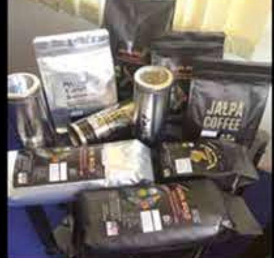
(58) Hospitality, Food & Wine, Monthly

Arabica coffee beans are known around the world as one of the best coffee beans and this is what gives our various coffee products its unique taste. Our organically grown coffee has been thoroughly consistent over the years and has been positively accepted by coffee lovers worldwide.